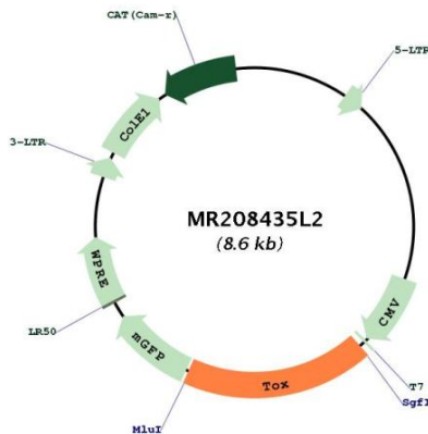
Circular map for MR208435L2