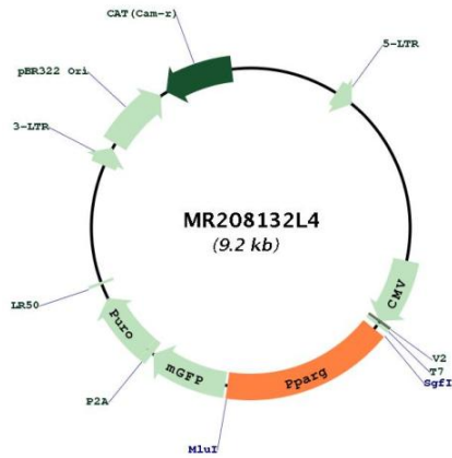
Circular map for MR208132L4