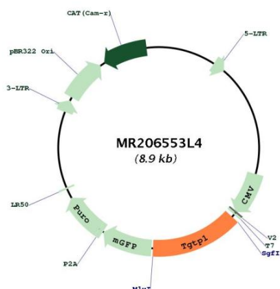
Circular map for MR206553L4