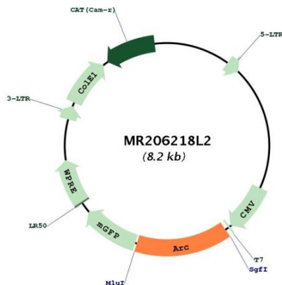
Circular map for MR206218L2