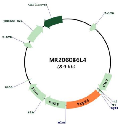
Circular map for MR206086L4