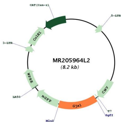
Circular map for MR205964L2