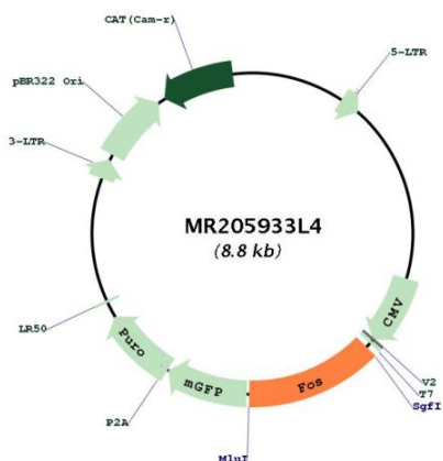
Circular map for MR205933L4