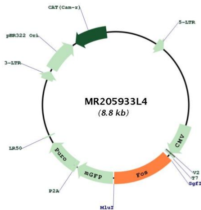
Circular map for MR205933L4