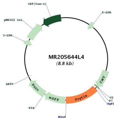
Circular map for MR205644L4