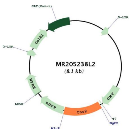
Circular map for MR205238L2