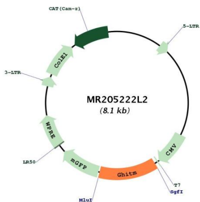
Circular map for MR205222L2