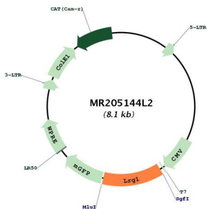
Circular map for MR205144L2