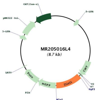
Circular map for MR205016L4