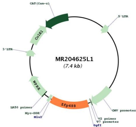
Circular map for MR204625L1