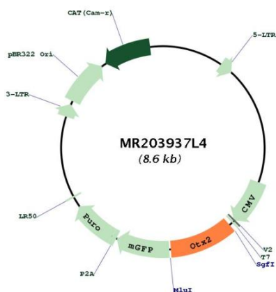
Circular map for MR203937L4