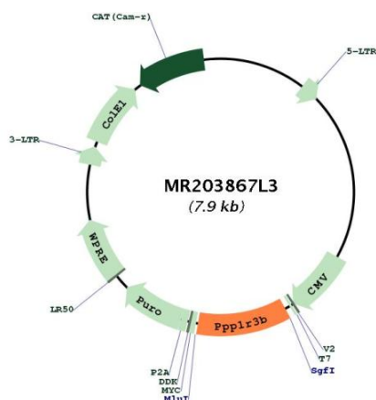
Circular map for MR203867L3