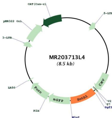
Circular map for MR203713L4