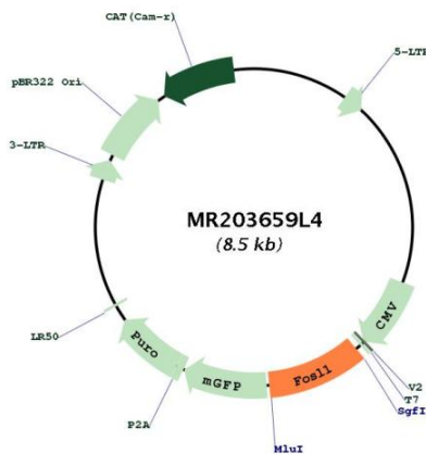
Circular map for MR203659L4