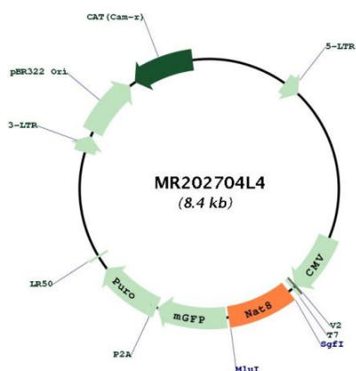
Circular map for MR202704L4