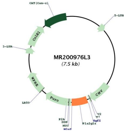
Circular map for MR200976L3