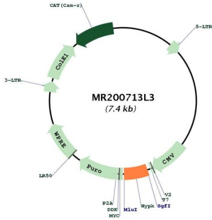
Circular map for MR200713L3