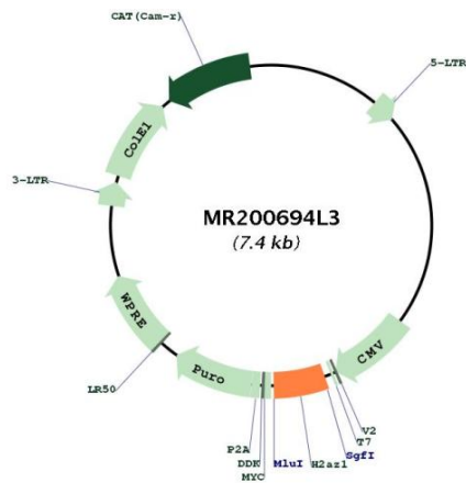
Circular map for MR200694L3