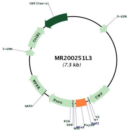
Circular map for MR200251L3