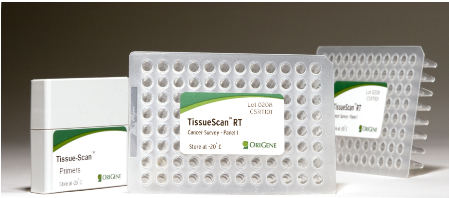
TissueScan product image.