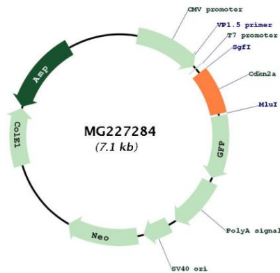
Circular map for MG227284