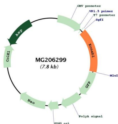
Circular map for MG206299