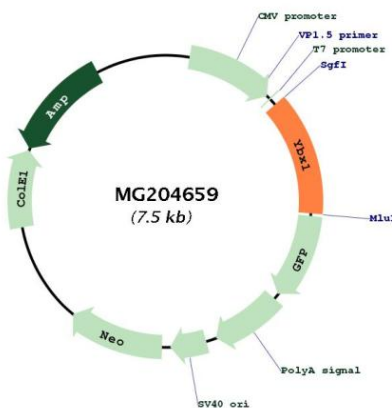
Circular map for MG204659