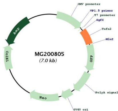
Circular map for MG200805