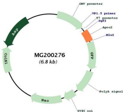
Circular map for MG200276