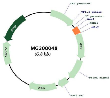
Circular map for MG200048