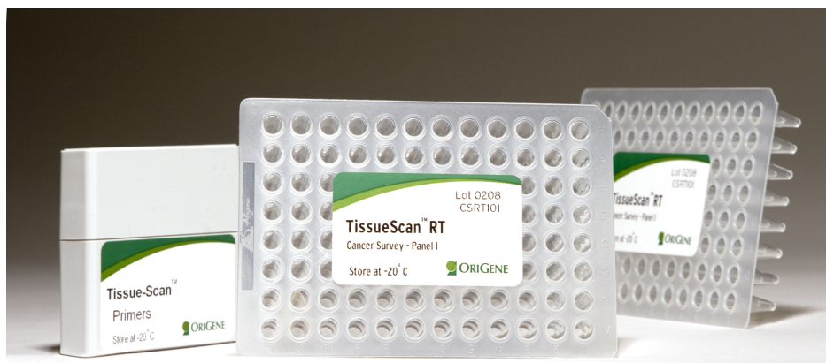
TissueScan product image.