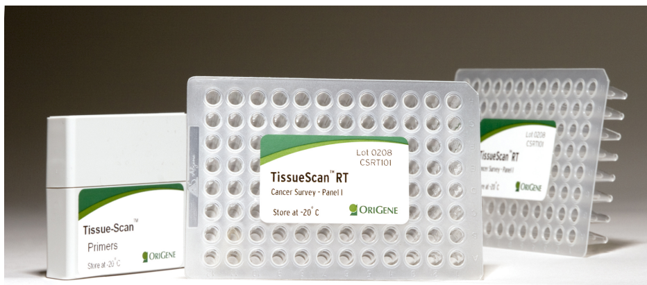
TissueScan product image.