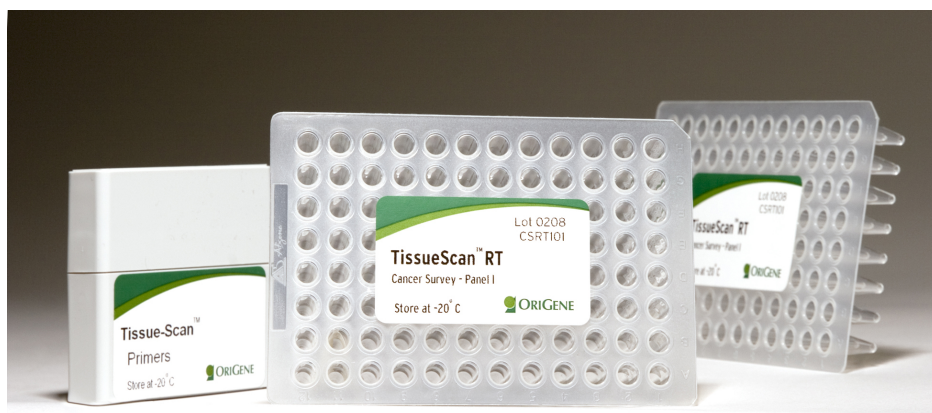
TissueScan product image.