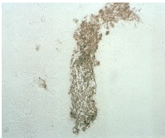
IHC staining of human tonsil frozen section with clone 706F9 (DX0281)