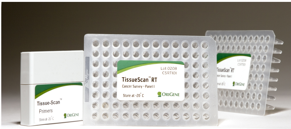
TissueScan product image.