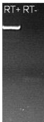
RNA RT-PCR Image