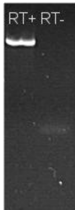
RNA RT-PCR Image