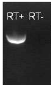
RNA RT-PCR Image