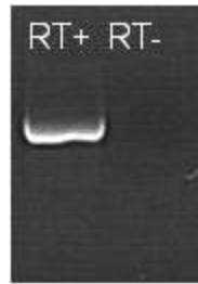
RNA RT-PCR Image