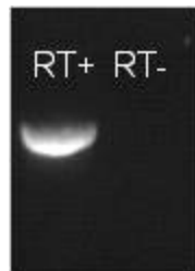
RNA RT-PCR Image