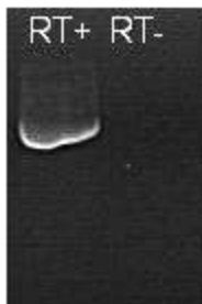
RNA RT-PCR Image