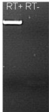
RNA RT-PCR Image