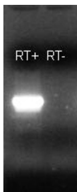
RNA RT-PCR Image