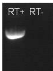
RNA RT-PCR Image