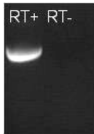
RNA RT-PCR Image