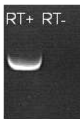
RNA RT-PCR Image