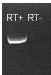
RNA RT-PCR Image