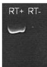
RNA RT-PCR Image