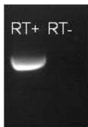
RNA RT-PCR Image