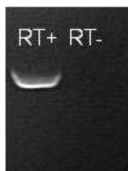
RNA RT-PCR Image