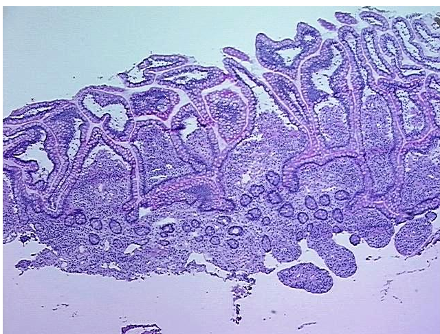
DNA - 4x.